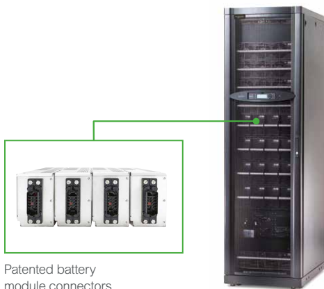
Patented battery module connectors

The ENERGY STAR program is aimed at reducing pollutants caused by the inefficient use of energy, while also making it easy for consumers to identify and purchase the most energy-efficient products. This program distinguishes UPS systems with efficiency ratings in the top 25 percent of the market. Qualified UPS units perform with excellence at 25, 50, 75, and 100 percent load levels, as verified by an independent certification body. By requiring consistent measurement methodology and the publication of test results, the ENERGY STAR program empowers consumers to accurately compare UPS units from multiple vendors.