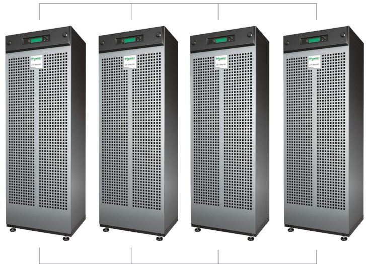
Four units in parallel